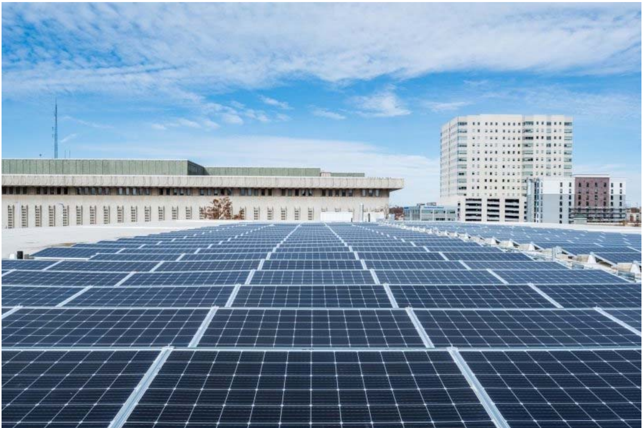
SOLAR PHOTOVOLTAIC SYTEM