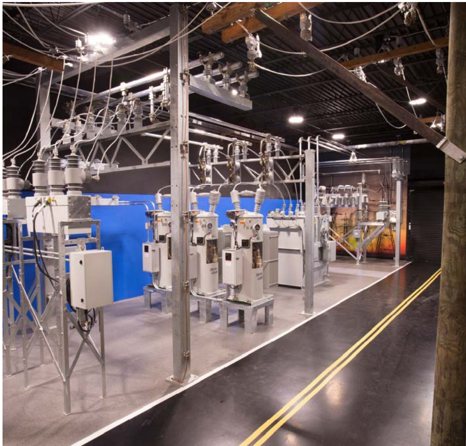
Eaton PSEC Utility Substation Equipment Demonstration

Address: Eaton—Entrance 2 (PSEC), 130 Commonwealth Drive, Warrendale, PA 15086 (ph.(724) 779-5906)